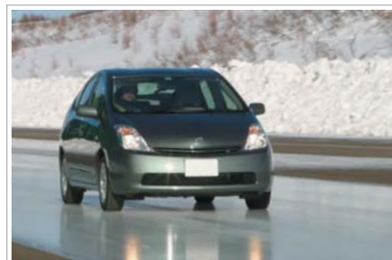
All weather performance testing for vehicle Hydraulics